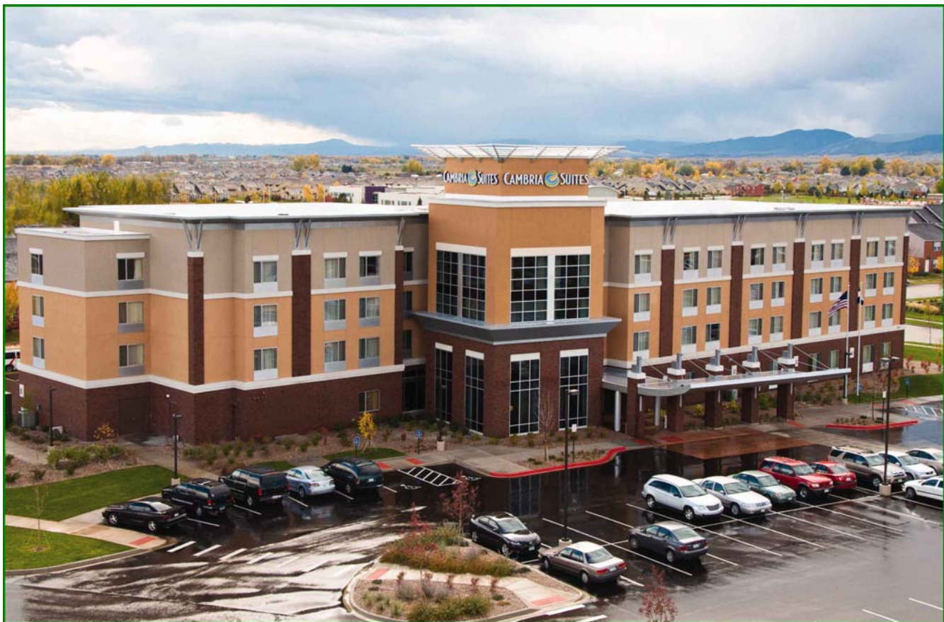
Fig. 2 – The Cambria Suites Hotel was selected for HHC 2009.